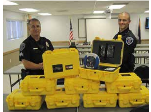
Marana Police Department officers with AEDs provided by the Gootter Foundation

Police officers are often first on the scene when a cardiac arrest is reported. Although one can never predict when and where a sudden cardiac event can take place, by placing AEDs in patrol cars with officers who have been trained in how to use these devices, there is a greater chance a sudden cardiac victim can be saved.