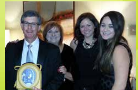
The Charles Family generously purchased an AED at the live auction